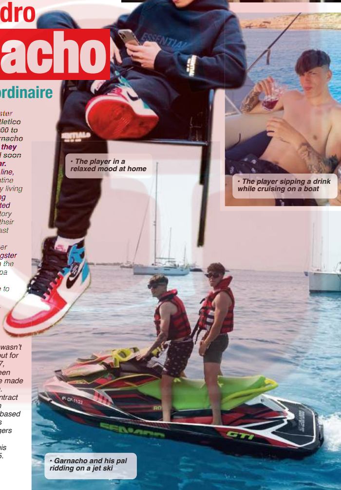
• The player in a relaxed mood at home