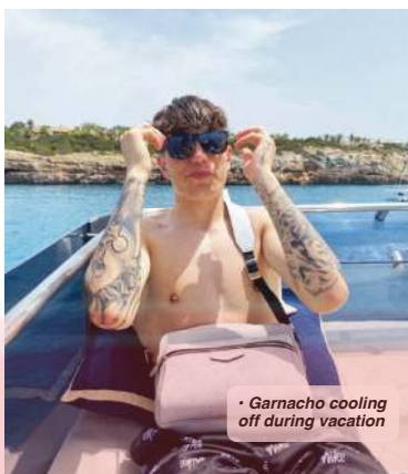
• Garnacho cooling off during vacation