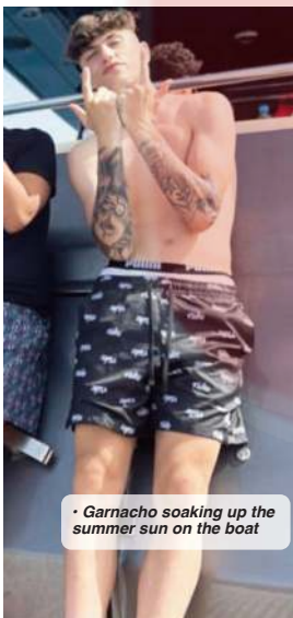
• Garnacho soaking up the summer sun on the boat

Garnacho is on a contract of £1,500 per week with Manchester United but based on his performance, it is believed that his managers would now push for an enhanced deal before his contract expires in 2025.