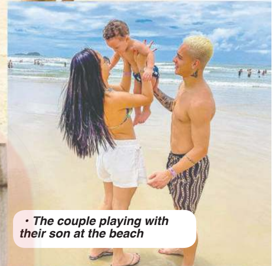
• The couple playing with their son at the beach