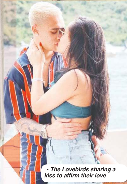
• The Lovebirds sharing a kiss to affirm their love