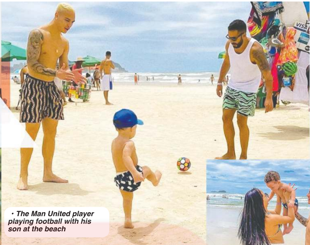
• The Man United player playing football with his son at the beach