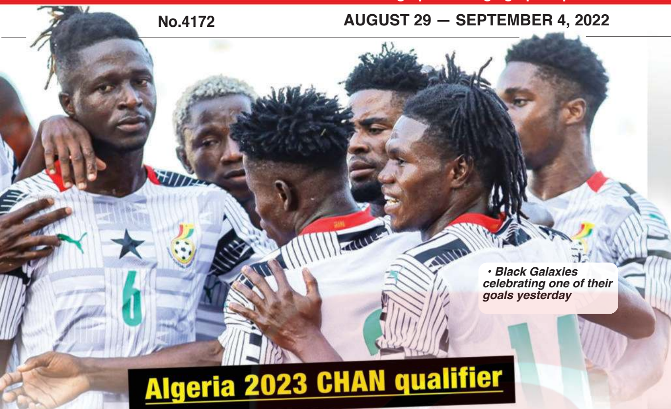
• Black Galaxies celebrating one of their goals yesterday