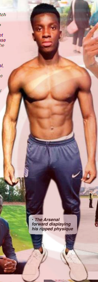
• The Arsenal forward displaying his ripped physique