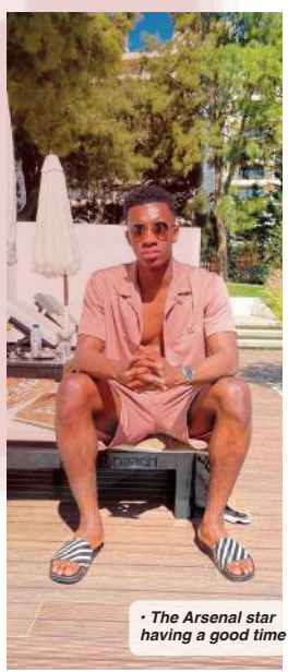
• The Arsenal star having a good time