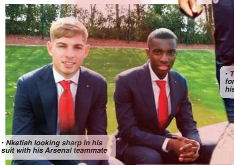
• Nketiah looking sharp in his suit with his Arsenal teammate