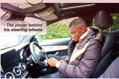
• The player behind his steering wheels