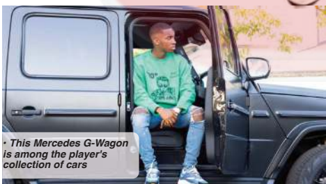
• This Mercedes G-Wagon is among the player's collection of cars