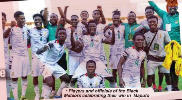
• Players and officials of the Black Meteors celebrating their win in Maputo