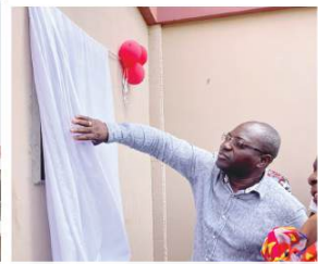
• Martin Adjei-Mensah Korsah, Minister of Local Government, Decentralisation and Rural Development, unveiling a plaque to inaugurate one of the markets